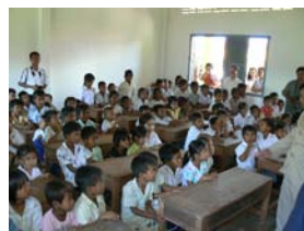
School with three rooms built by CSAJ and Brastel in 2007

We are looking forwards to having your support. The donation can be wired to the following account: Number: 12120-83554581 (Postal Saving, Normal Account) Name: Zainichi Kanbojia Ryuugakusei Kyoukai Please write: Charity 2009